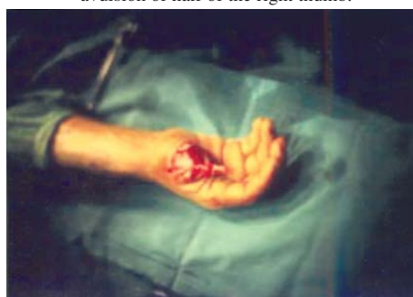
Fig. (3-B): Fixation of the filleted distal phalanx to the amputation stump.