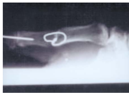
Fig. (1-D): Arthrodesis of MPJ by wire loop and the IPJ by K-wire.