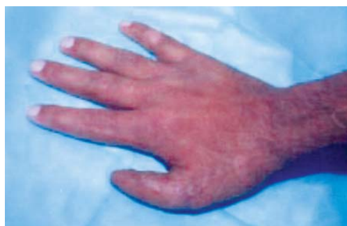
Fig. (3-C): Late post-operative view.