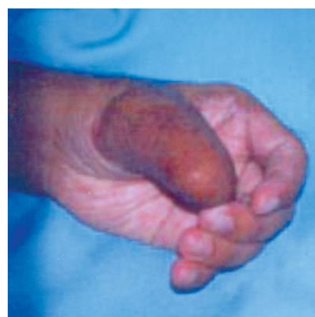
Fig. (1-F): Opposition of the fingers to the thumb.