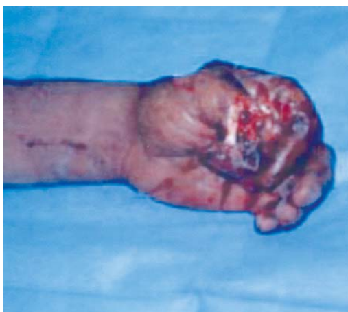
Fig. (2-A): Pre-operative view of case No. 2. Severe crushing of the proximal phalanges of the left thumb and index.