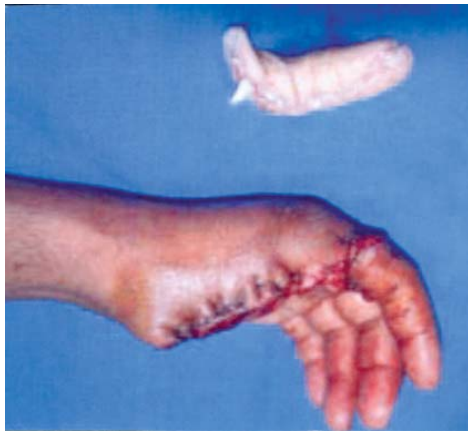
Fig. (1-A): Pre-operative view of case No. 1. Amputated left thumb at MPJ level by electric saw with longitudinal lacerations along the volar surface.