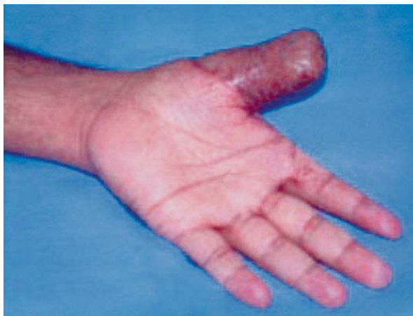
Fig. (1-E): Post-operative view of the flap.