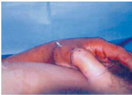
Fig. (1-C): Tubed ipsilateral groin flap.