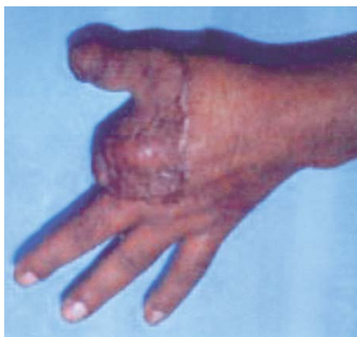
Fig. (2-B): Post-operative view.