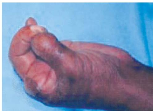
Fig. (2-C): Opposition of the middle finger to the thumb.