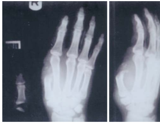
Fig. (1-B): Pre-operative X-ray.