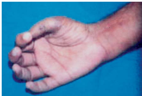
Fig. (3-D): Opposition of the fingers.